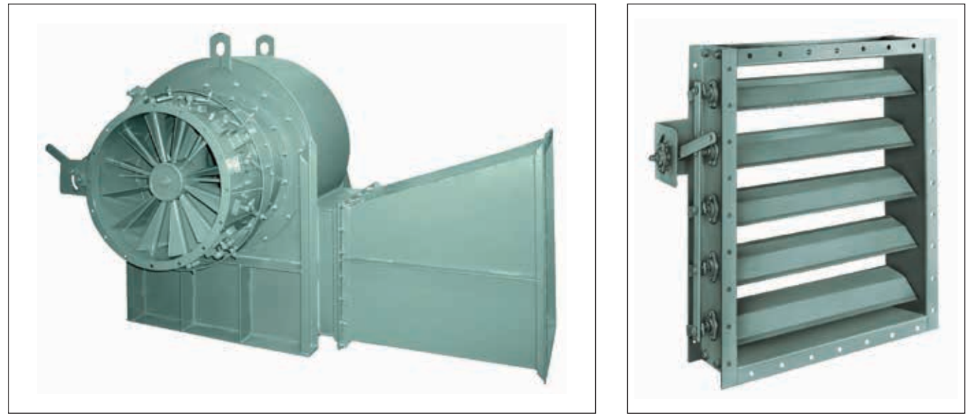
Figure 2A (above, left): A fan variable inlet vane (VIV) with all the blades in sync. Figure 2B (above, right): A fan inlet parallel blade damper with all the blades in sync.

bearings, couplings, actuator, and damper linkage(s). Maintaining a record over time of vibration and temperature levels for both the motor and fan bearings makes it easier to identify possible bearing, coupling, and alignment issues.