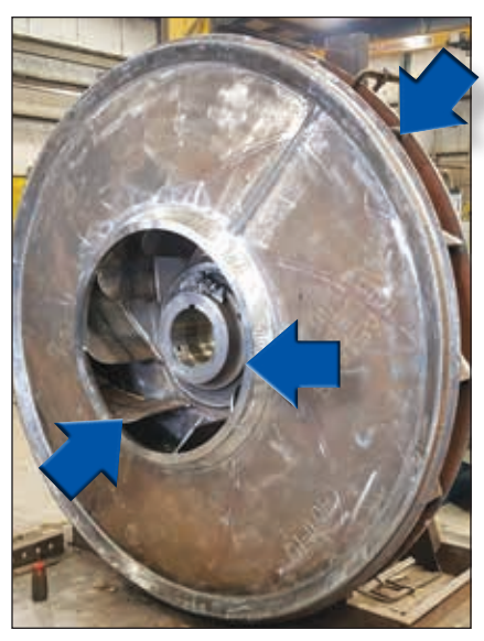
Figure 5: Here are the most common areas to look for cracks in the impeller.

It is recommended to check for cracks and wear on the impeller wheel every year, especially on older fans that may be reaching their fatique life or on fans moving a large dust load. If you find cracks or worn sections and want to repair them in the field, obtain the weld procedure from the fan manufacturer. It is very common to use high-strength steel that requires special welding. Cracks in the impeller or severely worn parts can be very dangerous; they should be repaired, or a new impeller wheel should be purchased as soon as possible. Figure 5 shows three of the most common areas to look for fan impeller cracks and wear.