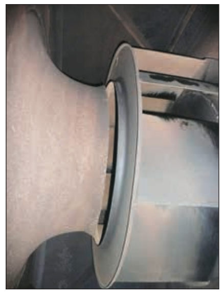
Figure 4: An incorrect setting of the inlet cone to the impeller.

rated from the impeller wheel. This is an incorrect setting for the inlet cone. The cone should penetrate into the eye of the impeller per the manufacturer's recommendation.