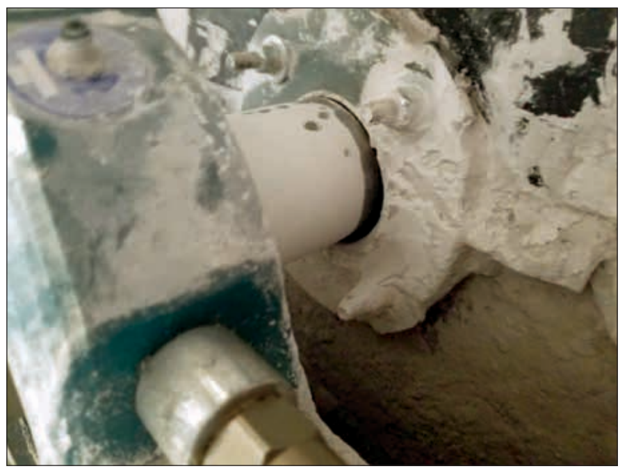
Figure 3: A worn fan shaft seal.

The inlet cone to an impeller wheel may become out of alignment or wear, allowing for a recirculation of the air inside the fan. The inlet cone must always penetrate the impeller inlet and have the proper radial clearance (gap) between the impeller inlet and inlet cone. A gap will cause the fan to underperform. Figure 4 shows an inlet cone (stationary part) approximately 1 inch (25 mm) sepa-